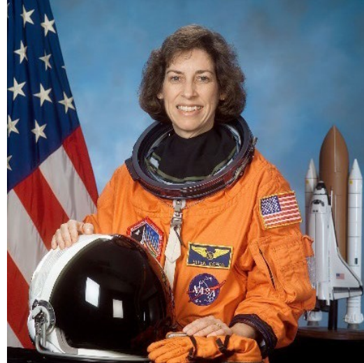
Ellen Ochoa , former Director, NASA Johnson Space Center, USA

Co-Founder and CEO, Glamsquad; Advisor, Gilt Groups, USA