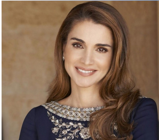
Queen Rania Al-Abdullah, Hashemite Kingdom of Jordan

Chairman, UK Export Finance (UKEF), United Kingdom